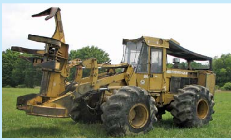
Cut, ride, drive - This Hydro Ax 611 B2 does it all.