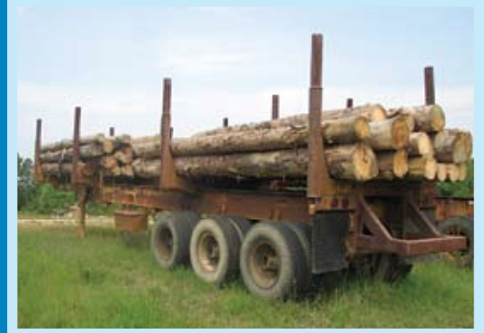
(2) Triple-axes on this auction - solid & ready for a load.