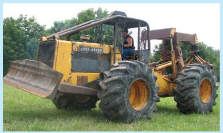
Need a skidder big enough to pull up a war ship - anchor this JD 740 w/an angle & front blade also