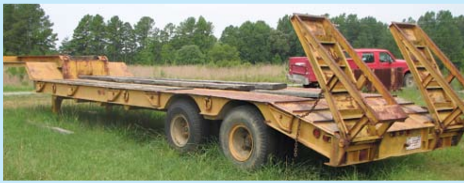
Straight as an arrow is this 25-ton lowboy